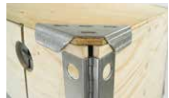
Lid with corners