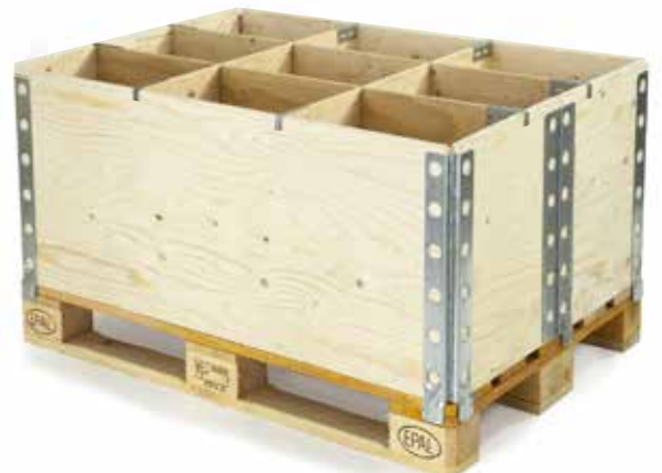
Viko with internal dividers