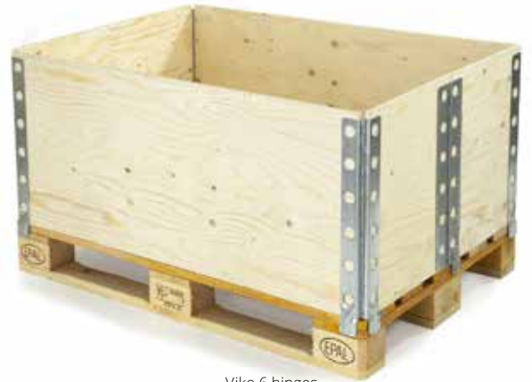
Viko 6 hinges

The Viko crate is designed for extensive customisation with: internal dividers, customised shaped sheets, prints, saddles, handles, wedges, locking system of tabs and slots, and spacers.