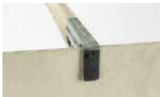
Hook for internal dividers