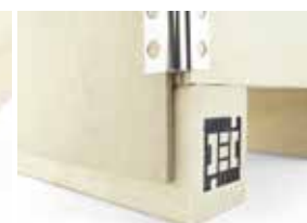
Side descending on the 2-way beam