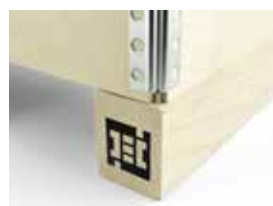
Side equal to the 2-way beam