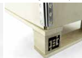
Side equal to the 4-way pallet