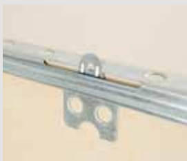
Locking system of tabs and slots