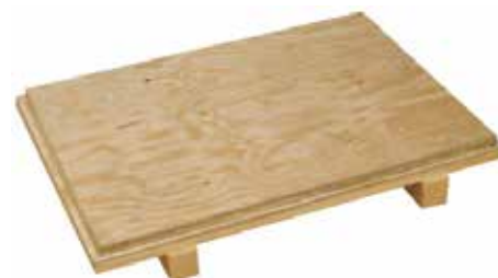
2 way with plywood sheet