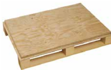
4 way with plywood sheet